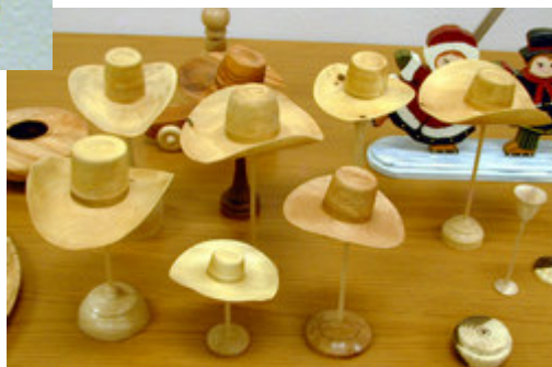
Pete Carta...the mad hatter